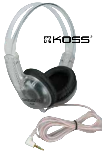
C. KOSS CL-5 Clear Headphones Item #5158302099—$8.00