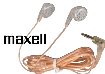
C. Maxell Clear Earbuds Item #5172801099—$4.65