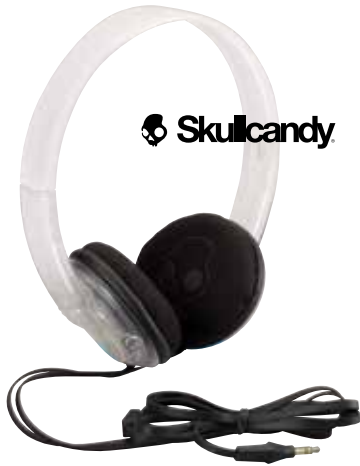
A. Skull Candy Clear Headphones Item #5326301099—$34.95