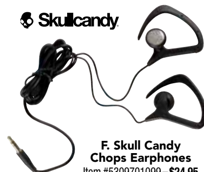
F. Skull Candy Chops Earphones Item #5309701099—$24.95