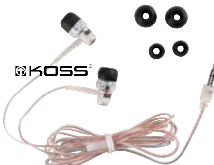
H. Koss CL-24 Earbuds Three Shapes Item #5184201099—$21.45