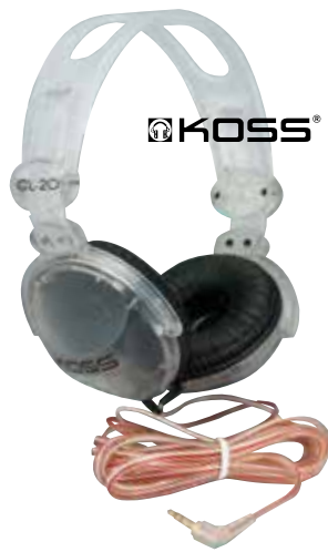
B. KOSS CL-20 Clear Headphones Item #5128202099—$25.50