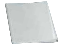
Clear CD Wallet Item #5059801099-$1.25