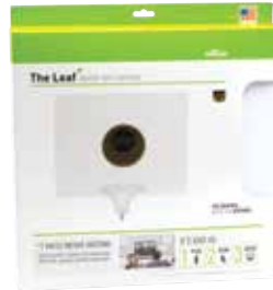
Leaf HDTV Digital TV Antenna Item #8005501099-$49.95