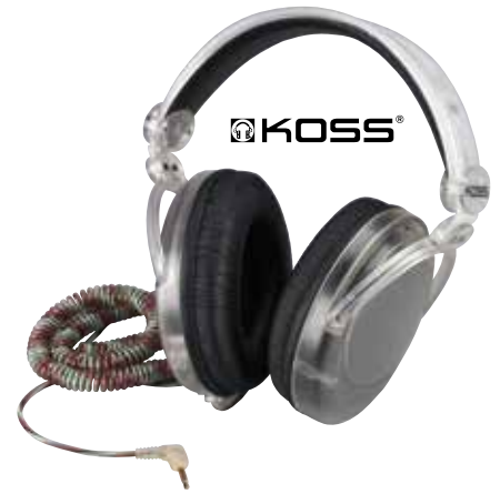
D. KOSS CL-80 Clear Headphones Item #5130202099—$46.00