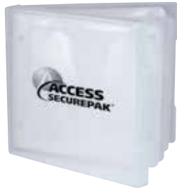
Clear 10-CD Case Item #8014901099-$6.95