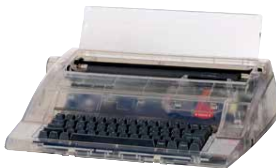
Swintec Electric Typewriter Model #2410CC 1-Line Correction Memory Pitch Selector - 10, 12, 15 Line Space & Tab Selector Item #5045101099—$209.00