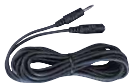
6 ft. Non-Coiled Headphone Extension with Mini Jack Item #5082901099—$4.25