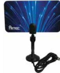
Artec Digital Antenna Item #5155601099-$15.25