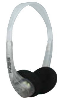
J. KOSS CL-2 Clear Headphones 1 Year Limited Warranty Item #5128101099—$6.40