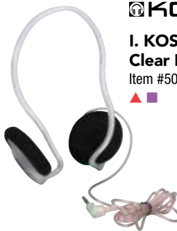
I. KOSS CL-9 Clear Headphones Item #5066001099—$9.30