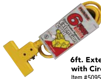
6ft. Extension Cord with Circuit Breaker Item #5095801099-$12.00