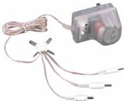
Clear Adapter SSU A96-7 Fits Sentry TR792, Sony WM-FX193 FP, AMP'D CD Player Item #5158901099—$7.70