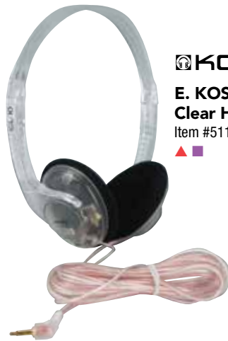
E. KOSS CL-10 Clear Headphones Item #5111304099—$22.85