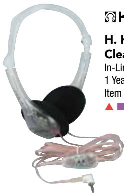
H. KOSS CL-4 Clear Headphones In-Line Volume Control 1 Year Limited Warranty Item #5128301099—$13.10