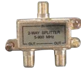
Two-Way Hybrid Signal Splitter Item #5013101099-$3.25