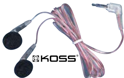
A. KOSS CL-3 Clear Earbuds Item #5029401099—$3.85