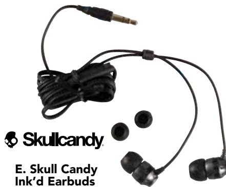
E. Skull Candy Ink'd Earbuds Item #5309601099—$22.50