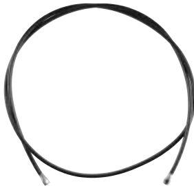
6 ft. Heavy Duty Coaxial Cable Item #5304701099-$4.95