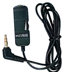
Koss VC/20 Volume Control Item #5006101099—$8.80