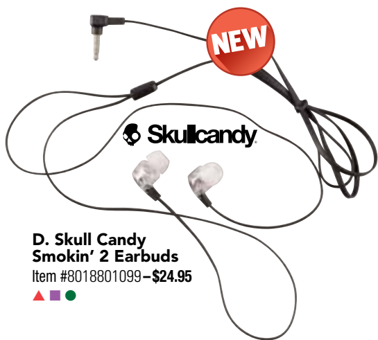
D. Skull Candy Smokin' 2 Earbuds Item #8018801099—$24.95