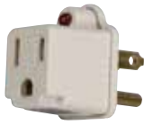
Single Line/Single Outlet Surge Protector Item #5018001099-$4.00