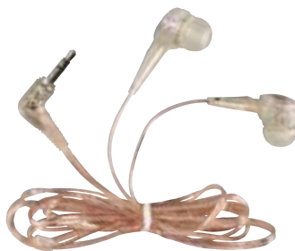
B. Clear Earbuds Item #5175201099—$7.10 Replacement Clear Ear Pads (not pictured) Item #5175202099—$1.10