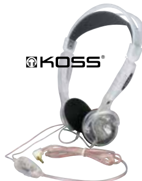
F. KOSS CL-PRO Clear Headphones Item #5066201099—$18.10