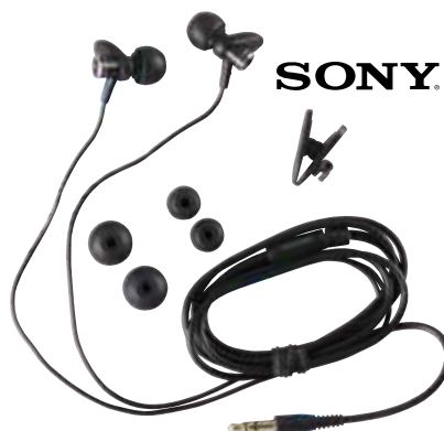
G. Sony Rock 'n Earbuds MDR-EX102P Item #5332601099—$24.95