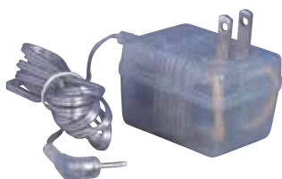
Clear Adapter Fits Sony WM-FX193 FP Item #5152801099—$10.60