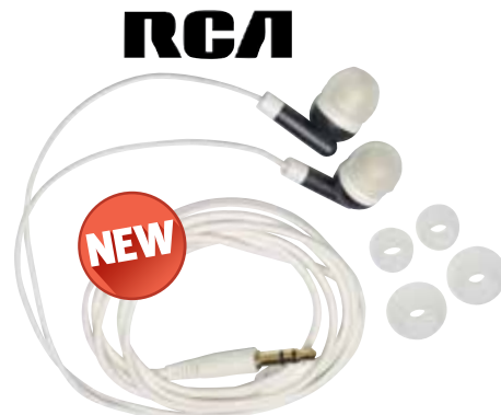
I. RCA Squish Earbuds Item #8033901004—$12.95