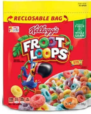
$1.95 / EA R Kellogg's 3.1 oz. Froot Loops Cereal #80005257