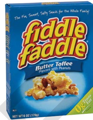
$2.00 / EA K Fiddle Faddle 6 oz. Butter Toffee Popcorn with Peanuts #6607