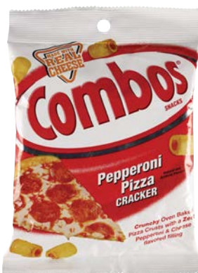
$3.80 / EA H G S Combos 6.3 oz. Pepperoni Pizza #6905