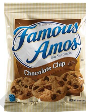
$0.60 / EA Famous Amos 2 oz. Chocolate Chip Cookies #850