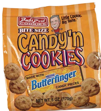
$1.75 / EA K G S Bud's Best 6 oz. Candy 'n Cookies - Butterfinger Mini Cookies #6386