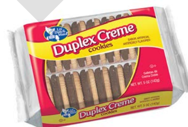
$2.15 / EA Lil Dutch Maid 5 oz. Duplex Creme Cookies #80002230