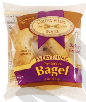
$0.75 / EA K H Golden Valley 4 oz. Everything Bagel #80004433