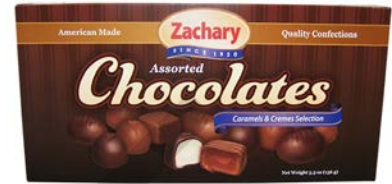
$3.65 / EA Zachary 5.5 oz. Assorted Chocolates #80002244