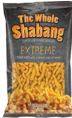
$2.75 / EA K H The Whole Shabang 9.5 oz. Extreme Crunchies #80001670