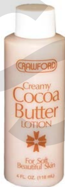
$0.60 / EA Crawford 4 oz. Cocoa Butter Lotion #20033