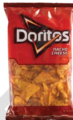
$2.90 / EA C Doritos 8 oz. Nacho Cheese Chips #10514