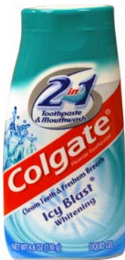
$5.25 / EA Colgate 4.6 oz. 2-in-1 Icy Blast Toothpaste #21748