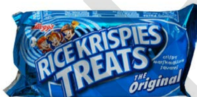
$1.00 / EA Kellogg's 1.3 oz. Original Rice Krispies Treats #2381