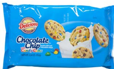
$4.50 / EA Delicious Bakery 12.4 oz. Chocolate Chip Cookies w/Candy Gems #80001496