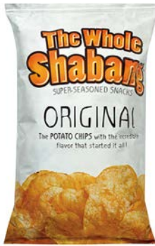
$2.30 / EA K H The Whole Shabang 6 oz. Original Potato Chips #5114