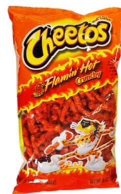
$2.80 / EA C G Cheetos 8 oz. Flamin' Hot Crunchy #7687