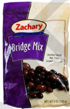
$2.65 / EA Zachary 5 oz. Bridge Mix Chocolate Covered Nuts #7286