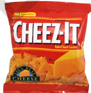
$0.60 / EA K Cheez-It 1.5 oz. Cheddar Crackers #9590