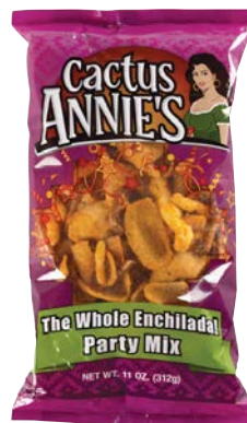
$2.75 / EA K H C Cactus Annie's 11 oz. "The Whole Enchilada" Party Mix #902