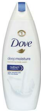
$6.75 / EA Dove 12 oz. Deep Moisture Body Wash #24034