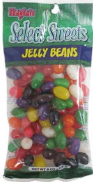
$1.75 / EA Select Sweets 8 oz. Jelly Beans #80002185