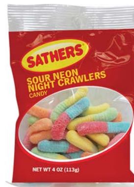
$1.00 / EA Sathers 4 oz. Sour Neon Worms #80000868