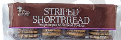
$3.00 / EA Oven Baked 13 oz. Fudge Striped Shortbread Cookies #80001120