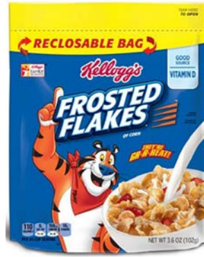
$1.95 / EA Kellogg's 3.6 oz. Frosted Flakes Cereal #80005254