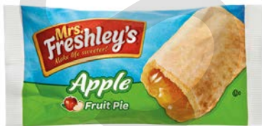
$1.15 / EA Mrs. Freshley's 4.5 oz. Apple Fruit Pie #9739