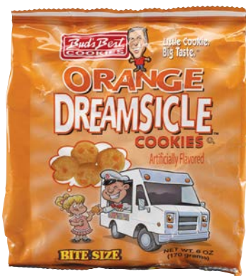
$1.80 / EA Bud's Best 6 oz. Orange Bite Delight Cookies #7924