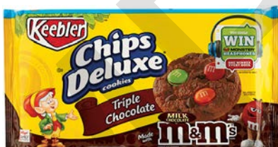
$6.35 / EA Keebler 11.6 oz. Chips Deluxe Triple Chocolate Cookies #80000616