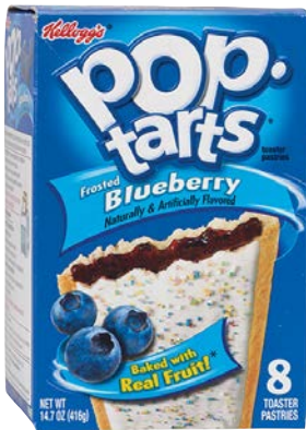
$3.75 / BX Kellogg's 14.7 oz. Frosted Blueberry Pop Tarts (8 Pk.) #10548