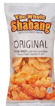
$1.35 / EA The Whole Shabang 2 oz. Pork Rinds #80003053