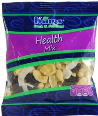
$1.40 / EA Kings Nut 3.25 oz. Health Mix #80003371