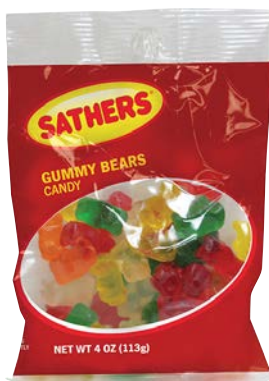
$1.00 / EA Sathers 4 oz. Gummy Bears #80000867