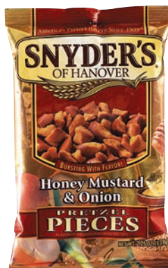
$1.25 / EA Snyder's 2.25 oz. Honey Mustard and Onion Pretzel Pieces #9553