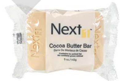
$0.70 / EA Next 1 - 5 oz. Cocoa Butter Soap (1 Bar) #22096