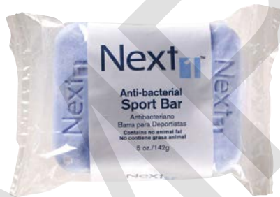
$1.00 / EA Next 1 - 5 oz. Anti-bacterial Sport Soap (1 Bar) #22098