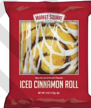
$1.15 / EA K C Market Square Bakery 4 oz. Iced Swirl Cinnamon Roll #6057