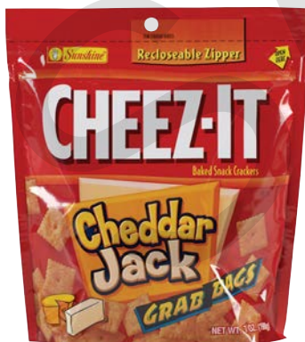
$4.00 / EA R Cheez-It 7 oz. Cheddar Jack Crackers #7452