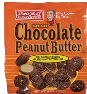
$1.75 / EA K Bud's Best 6 oz. Chocolate Peanut Butter Mini Cookies #6384