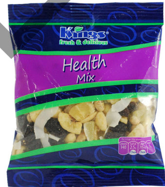
$1.40 / EA Kings Nut 3.25 oz. Health Mix #80003371