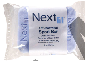
$1.00 / EA Next 1 - 5 oz. Anti-bacterial Sport Soap (1 Bar) #22098