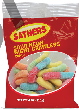
$1.00 / EA Sathers 4 oz. Sour Neon Worms #80000868