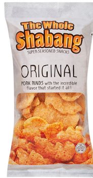
$1.35 / EA The Whole Shabang 2 oz. Pork Rinds #80003053