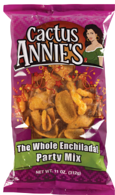
$2.75 / EA K H C Cactus Annie's 11 oz. "The Whole Enchilada" Party Mix #902