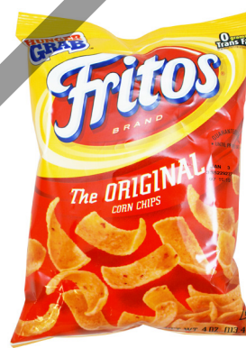
$1.55 / EA Fritos 4 oz. Regular Corn Chips #6378