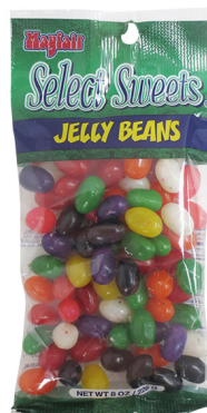
$1.75 / EA Select Sweets 8 oz. Jelly Beans #80002185