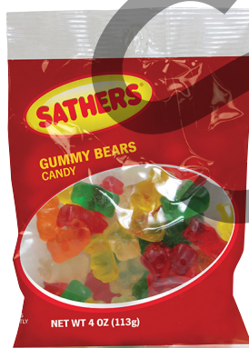
$1.00 / EA Sathers 4 oz. Gummy Bears #80000867