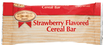
$0.40 / EA K Golden Valley 1.3 oz. Strawberry Cereal Bar #6045