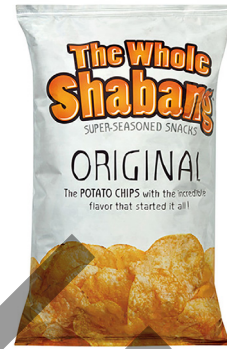
$2.30 / EA The Whole Shabang 6 oz. Original Potato Chips #5114 K H