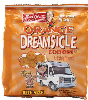
$1.80 / EA Bud's Best 6 oz. Orange Bite Delight Cookies #7924