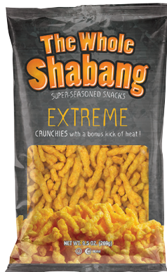
$2.75 / EA The Whole Shabang 9.5 oz. Extreme Crunchies #80001670 K H