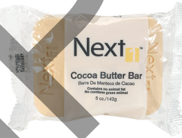
$0.70 / EA Next 1 - 5 oz. Cocoa Butter Soap (1 Bar) #22096