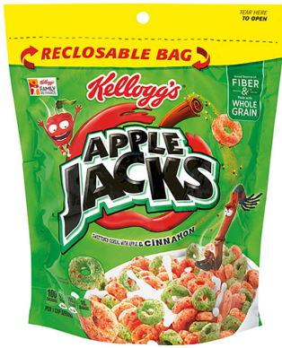
$1.95 / EA K R Kellogg's 3.1 oz. Apple Jacks Cereal #80005258