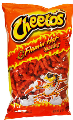
$2.80 / EA C G Cheetos 8 oz. Flamin' Hot Crunchy #7687