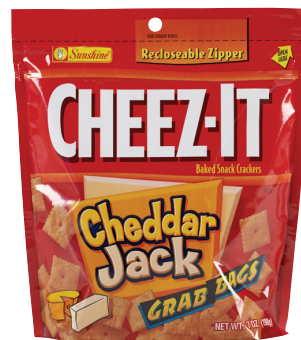
$4.00 / EA Cheez-It 7 oz. Cheddar Jack Crackers #7452 R