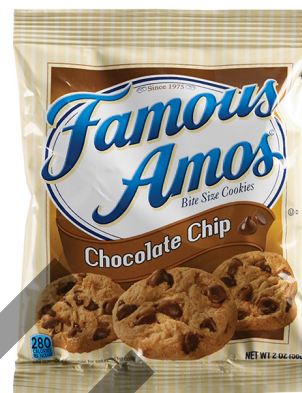
$0.60 / EA Famous Amos 2 oz. Chocolate Chip Cookies #850