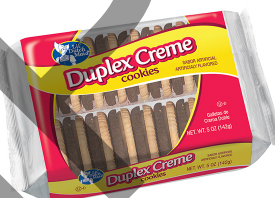
$2.15 / EA Lil Dutch Maid 5 oz. Duplex Creme Cookies #80002230