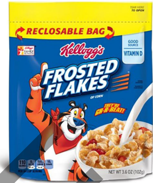
$1.95 / EA Kellogg's 3.6 oz. Frosted Flakes Cereal #80005254