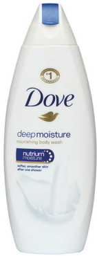
$6.75 / EA Dove 12 oz. Deep Moisture Body Wash #24034