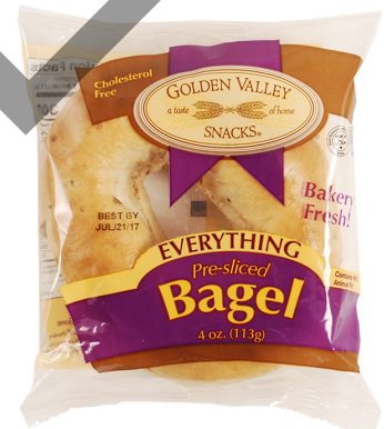
$0.75 / EA K H Golden Valley 4 oz. Everything Bagel #80004433