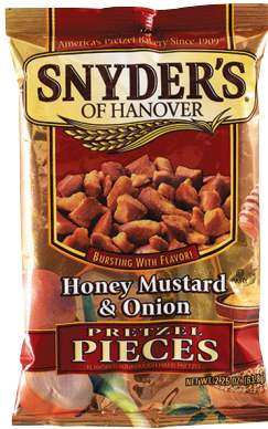
$1.25 / EA Snyder's 2.25 oz. Honey Mustard and Onion Pretzel Pieces #9553