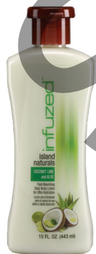
$2.00 / EA Infuzed Island Naturals 15 oz. Coconut Lime & Aloe Lotion #24967