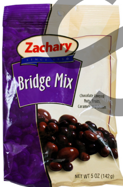
$2.65 / EA Zachary 5 oz. Bridge Mix Chocolate Covered Nuts #7286