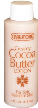
$0.60 / EA Crawford 4 oz. Cocoa Butter Lotion #20033