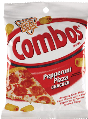
$3.80 / EA H G S Combos 6.3 oz. Pepperoni Pizza #6905