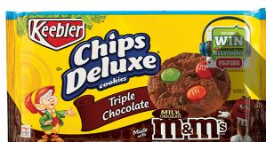
$6.35 / EA K Keebler 11.6 oz. Chips Deluxe Triple Chocolate Cookies #80000616