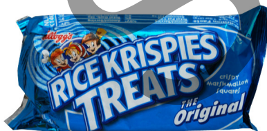
$1.00 / EA Kellogg's 1.3 oz. Original Rice Krispies Treats #2381