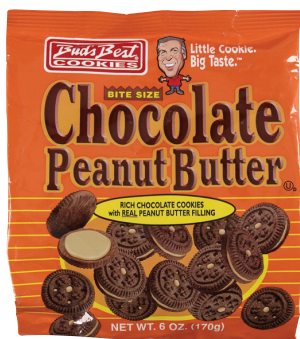
$1.75 / EA K Bud's Best 6 oz. Chocolate Peanut Butter Mini Cookies #6384