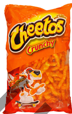
$2.95 / EA C G Cheetos 9 oz. Crunchy #7683