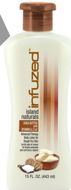
$2.00 / EA Infuzed Island Naturals 15 oz. Shea Butter Lotion #24966