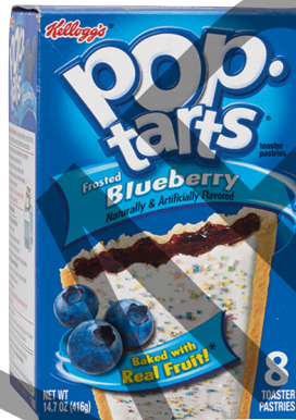
$3.75 / BX Kellogg's 14.7 oz. Frosted Blueberry Pop Tarts (8 Pk.) #10548