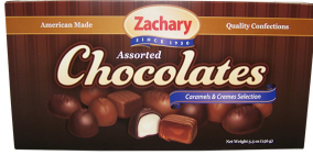
$3.65 / EA Zachary 5.5 oz. Assorted Chocolates #80002244