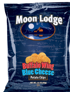
$0.65 / EA K H Moon Lodge 1.5 oz. Buffalo Wing Blue Cheese Potato Chips #80000963