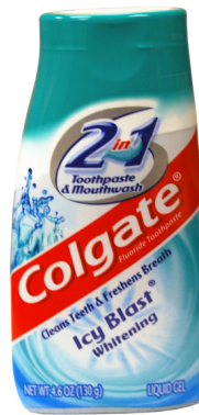
$5.25 / EA Colgate 4.6 oz. 2-in-1 Icy Blast Toothpaste #21748