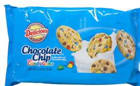
$4.50 / EA Delicious Bakery 12.4 oz. Chocolate Chip Cookies w/ Candy Gems #80001496