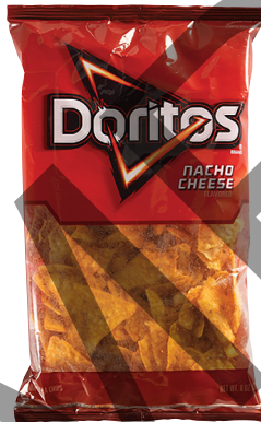
$2.90 / EA C Doritos 8 oz. Nacho Cheese Chips #10514