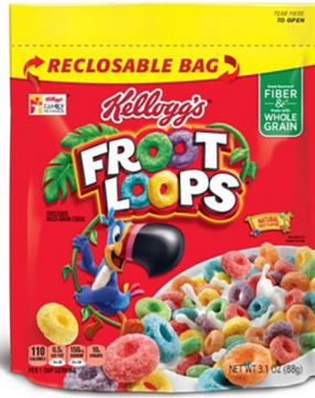
$1.95 / EA R Kellogg's 3.1 oz. Froot Loops Cereal #80005257