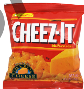
$0.60 / EA Cheez-It 1.5 oz. Cheddar Crackers #9590 K