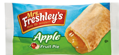
$1.15 / EA Mrs. Freshley's 4.5 oz. Apple Fruit Pie #9739