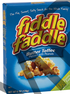
$2.00 / EA Fiddle Faddle 6 oz. Butter Toffee Popcorn with Peanuts #6607 K