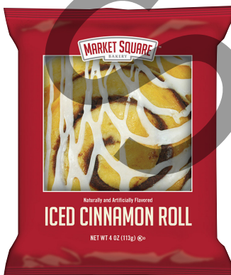
$1.15 / EA K C Market Square Bakery 4 oz. Iced Swirl Cinnamon Roll #6057