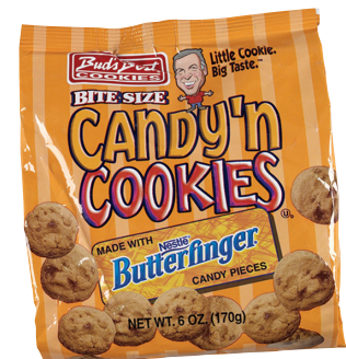
$1.75 / EA Bud's Best 6 oz. Candy 'n Cookies - Butterfinger Mini Cookies #6386 K G S