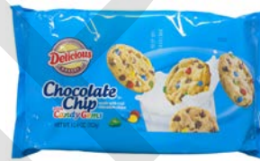
$4.50 / EA Delicious Bakery 12.4 oz. Chocolate Chip Cookies w/ Candy Gems #80001496 Item Limit 5