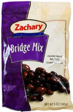
$2.65 / EA Zachary 5 oz. Bridge Mix Chocolate Covered Nuts #7286 Item Limit 5