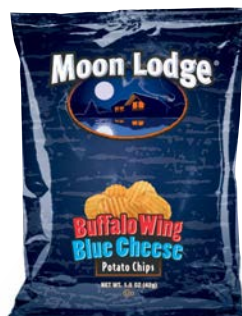
$0.65 / EA K H Moon Lodge 1.5 oz. Buffalo Wing Blue Cheese Potato Chips #80000963 Item Limit 5