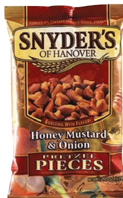
$1.25 / EA Snyder's 2.25 oz. Honey Mustard and Onion Pretzel Pieces #9553 Item Limit 5