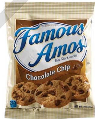
$0.60 / EA Famous Amos 2 oz. Chocolate Chip Cookies #850 Item Limit 5