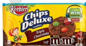
$6.35 / EA K Keebler 11.6 oz. Chips Deluxe Triple Chocolate Cookies #80000616 Item Limit 5