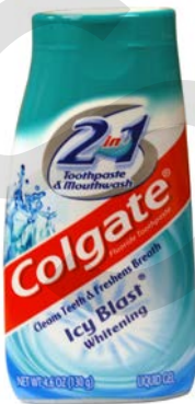
$5.25 / EA C Colgate 4.6 oz. 2-in-1 Icy Blast Toothpaste #21748 Item Limit 2