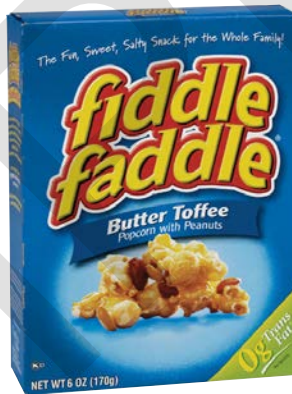
$2.00 / EA K Fiddle Faddle 6 oz. Butter Toffee Popcorn with Peanuts #6607 Item Limit 5