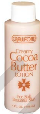
$0.60 / EA C Crawford 4 oz. Cocoa Butter Lotion #20033 Lotion Limit 2