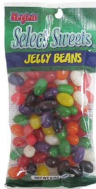
$1.75 / EA Select Sweets 8 oz. Jelly Beans #80002185 Item Limit 5