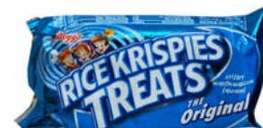
$1.00 / EA Kellogg's 1.3 oz. Original Rice Krispies Treats #2381 Item Limit 5