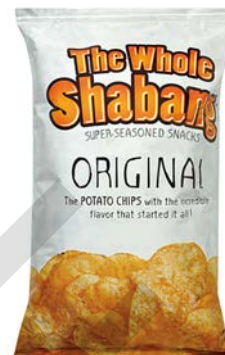
$2.30 / EA K H The Whole Shabang 6 oz. Original Potato Chips #5114 Item Limit 5