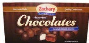
$3.65 / EA Zachary 5.5 oz. Assorted Chocolates #80002244 Item Limit 5