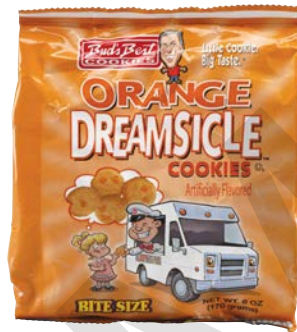
$1.80 / EA Bud's Best 6 oz. Orange Bite Delight Cookies #7924 Item Limit 5