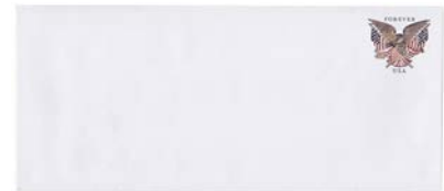
$0.56 / EA #10 Stamped Envelope #983 Item Limit 10