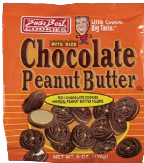
$1.75 / EA K Bud's Best 6 oz. Chocolate Peanut Butter Mini Cookies #6384 Item Limit 5