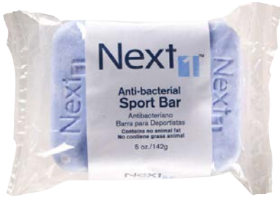
$1.00 / EA C Next 1 - 5 oz. Anti-bacterial Sport Soap (1 Bar) #22098 Soap Limit 2