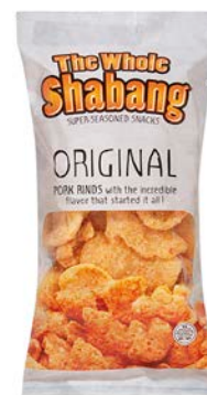
$1.35 / EA The Whole Shabang 2 oz. Pork Rinds #80003053 Item Limit 5