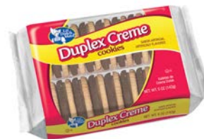
$2.15 / EA Lil Dutch Maid 5 oz. Duplex Creme Cookies #80002230 Item Limit 5