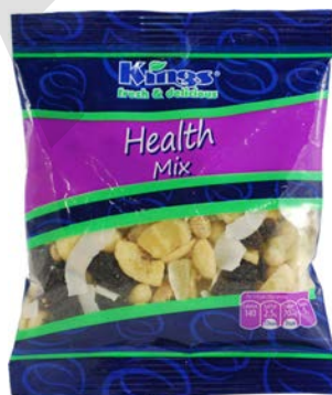
$1.40 / EA Kings Nut 3.25 oz. Health Mix #80003371 Item Limit 5