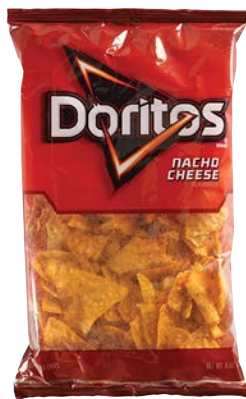
$2.90 / EA C Doritos 8 oz. Nacho Cheese Chips #10514 Item Limit 5