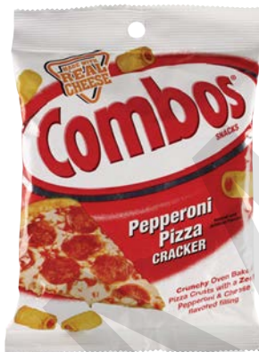
$3.80 / EA H G S Combos 6.3 oz. Pepperoni Pizza Cracker #6905 Item Limit 5