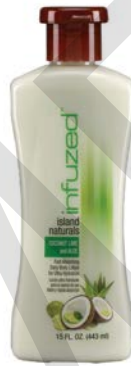
$2.00 / EA Infuzed Island Naturals 15 oz. Coconut Lime & Aloe Lotion #24967 Lotion Limit 2