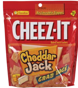
$4.00 / EA R Cheez-It 7 oz. Cheddar Jack Crackers #7452 Item Limit 5