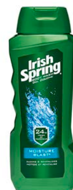
$7.00 / EA Irish Spring 18 oz. Moisture Blast Body Wash #80000574 Body Wash Limit 2