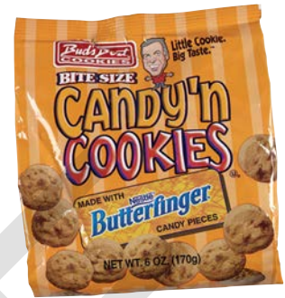
$1.75 / EA K G S Bud's Best 6 oz. Candy 'n Cookies - Butterfinger Mini Cookies #6386 Item Limit 5