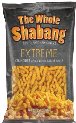
$2.75 / EA K H The Whole Shabang 9.5 oz. Extreme Crunchies #80001670 Item Limit 5