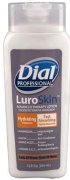
$3.75 / EA Dial 12 oz. Advanced Therapy Lotion #26045 Lotion Limit 2