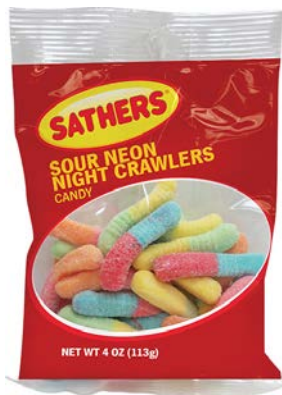
$1.00 / EA Sathers 4 oz. Sour Neon Worms #80000868 Item Limit 5