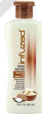
$2.00 / EA Infuzed Island Naturals 15 oz. Shea Butter Lotion #24966 Lotion Limit 2