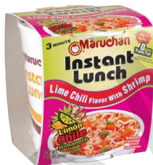
$0.65 / EA Maruchan Instant Lunch 2.25 oz. - Lime/Chili/Shrimp w/Habanero #1346 Item Limit 5