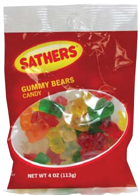
$1.00 / EA Sathers 4 oz. Gummy Bears #80000867 Item Limit 5