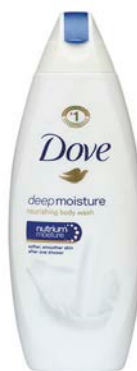
$6.75 / EA Dove 12 oz. Deep Moisture Body Wash #24034 Body Wash Limit 2