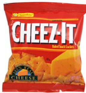
$0.60 / EA K Cheez-It 1.5 oz. Cheddar Crackers #9590 Item Limit 5