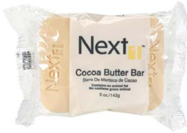
$0.70 / EA C Next 1 - 5 oz. Cocoa Butter Soap (1 Bar) #22096 Soap Limit 2