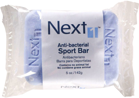
Next 1 - 5 oz. Anti-bacterial Sport Soap (1 Bar) #22098 $1.00 / EA