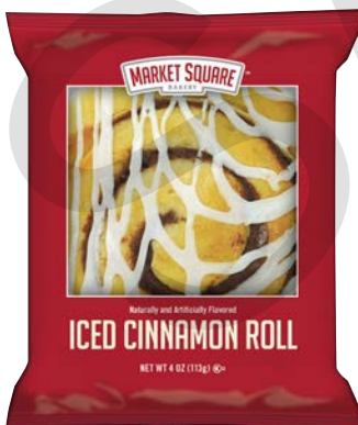
$1.15 / EA K C Market Square Bakery 4 oz. Iced Swirl Cinnamon Roll #6057