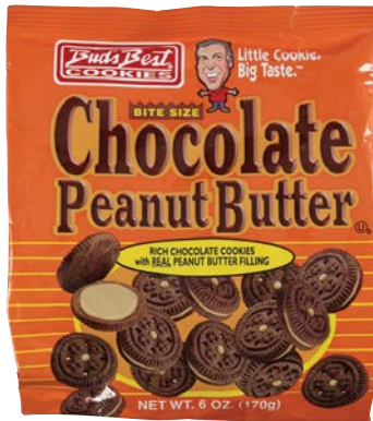
$1.75 / EA K Bud's Best 6 oz. Chocolate Peanut Butter Mini Cookies #6384