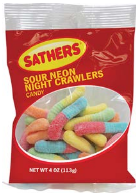
$1.00 / EA Sathers 4 oz. Sour Neon Worms #80000868