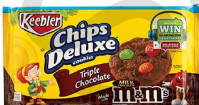
$6.35 / EA K Keebler 11.6 oz. Chips Deluxe Triple Chocolate Cookies #80000616