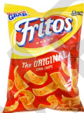
$1.55 / EA Fritos 4 oz. Regular Corn Chips #6378