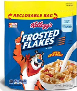
$1.95 / EA Kellogg's 3.6 oz. Frosted Flakes Cereal #80005254