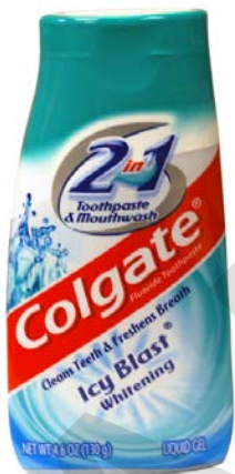
Colgate 4.6 oz. 2-in-1 Icy Blast Toothpaste #21748 $5.25 / EA