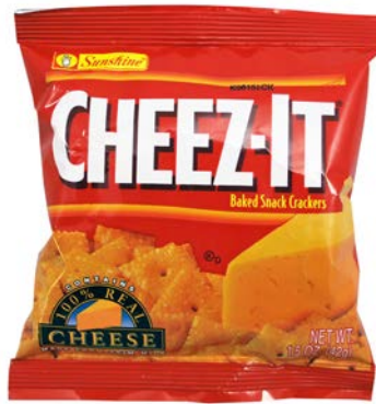
$0.60 / EA K Cheez-It 1.5 oz. Cheddar Crackers #9590