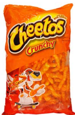
$2.95 / EA C G Cheetos 9 oz. Crunchy #7683