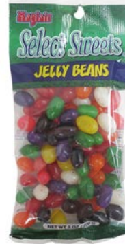
$1.75 / EA Select Sweets 8 oz. Jelly Beans #80002185