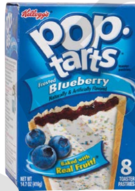
$3.75 / BX Kellogg's 14.7 oz. Frosted Blueberry Pop Tarts (8 Pk.) #10548