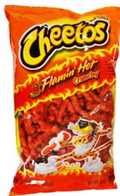
$2.80 / EA C G Cheetos 8 oz. Flamin' Hot Crunchy #7687