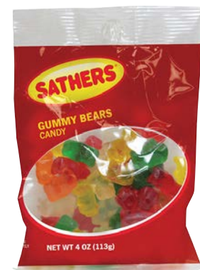
$1.00 / EA Sathers 4 oz. Gummy Bears #80000867