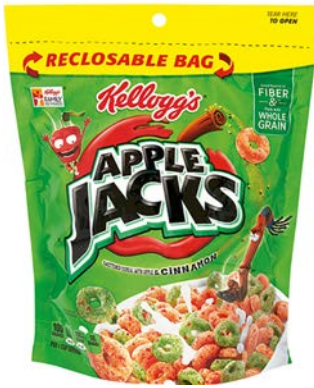
$1.95 / EA K R Kellogg's 3.1 oz. Apple Jacks Cereal #80005258