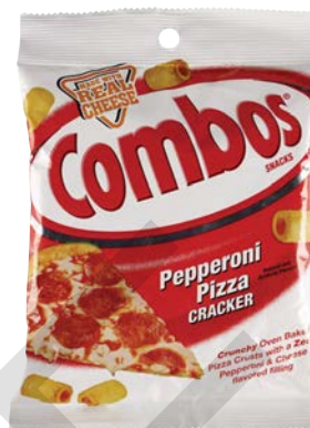
$3.80 / EA H G S Combos 6.3 oz. Pepperoni Pizza #6905