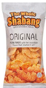
$1.35 / EA The Whole Shabang 2 oz. Pork Rinds #80003053