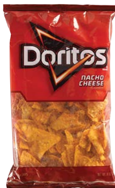
$2.90 / EA C Doritos 8 oz. Nacho Cheese Chips #10514