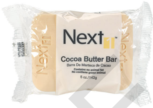
Next 1 - 5 oz. Cocoa Butter Soap (1 Bar) #22096 $0.70 / EA