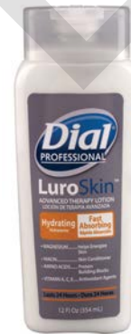
Dial 12 oz. Advanced Therapy Lotion #26045 $3.75 / EA