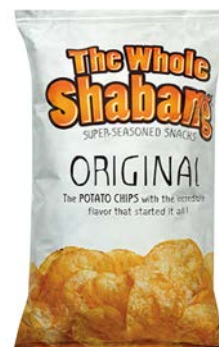
$2.30 / EA K H The Whole Shabang 6 oz. Original Potato Chips #5114