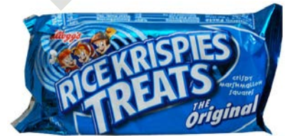
$1.00 / EA Kellogg's 1.3 oz. Original Rice Krispies Treats #2381