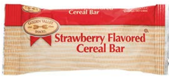
$0.40 / EA K Golden Valley 1.3 oz. Strawberry Cereal Bar #6045