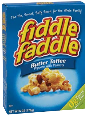
$2.00 / EA K Fiddle Faddle 6 oz. Butter Toffee Popcorn with Peanuts #6607