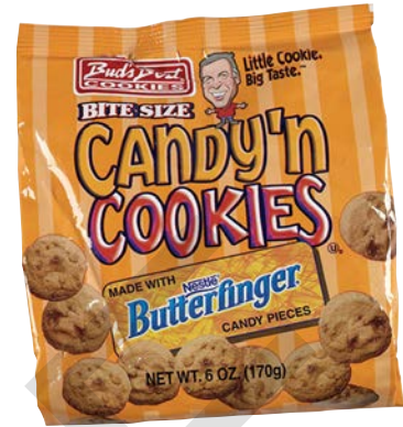
$1.75 / EA K G S Bud's Best 6 oz. Candy 'n Cookies - Butterfinger Mini Cookies #6386