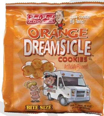
$1.80 / EA Bud's Best 6 oz. Orange Bite Delight Cookies #7924