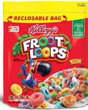
$1.95 / EA R Kellogg's 3.1 oz. Froot Loops Cereal #80005257