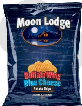
$0.65 / EA K H Moon Lodge 1.5 oz. Buffalo Wing Blue Cheese Potato Chips #80000963