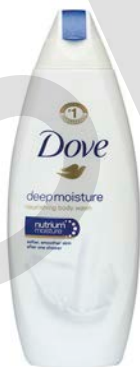
Dove 12 oz. Deep Moisture Body Wash #24034 $6.75 / EA