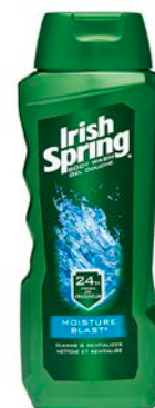
Irish Spring 18 oz. Moisture Blast Body Wash #80000574 $7.00 / EA