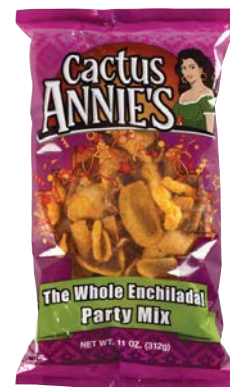
$2.75 / EA K H C Cactus Annie's 11 oz. "The Whole Enchilada" Party Mix #902