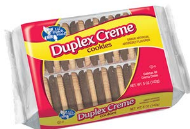
$2.15 / EA Lil Dutch Maid 5 oz. Duplex Creme Cookies #80002230