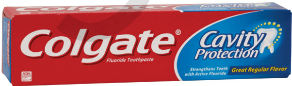
Colgate 4 oz. Great Regular Flavor Anticavity Toothpaste #80002779 $3.25 / EA